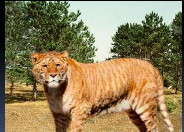
Bertram the Liger loves ANOVA